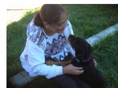
Granddaughter & Harvest @ 8 weeks.

1* INTRO TO INTERMEDIATE; Good to get ready for the Canine Good Citizen Test 2* INTRO TO OFF LEAD WORK; 3* KIDS & DOG'S; 4* PUPPY SOCIALS All are 4 weeks, cost of $65.00;