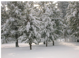
.First snow of 2012