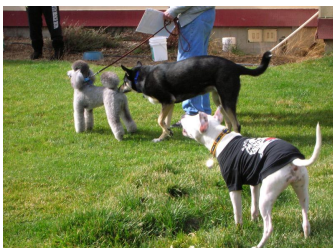
Canne Good Citizen Group after play party